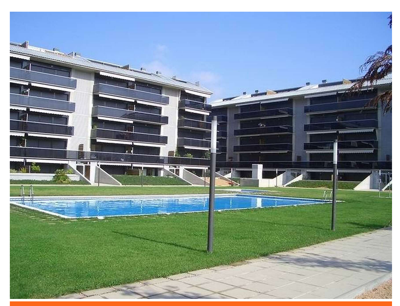
Duplex for sale in Sant Anton de Calonge